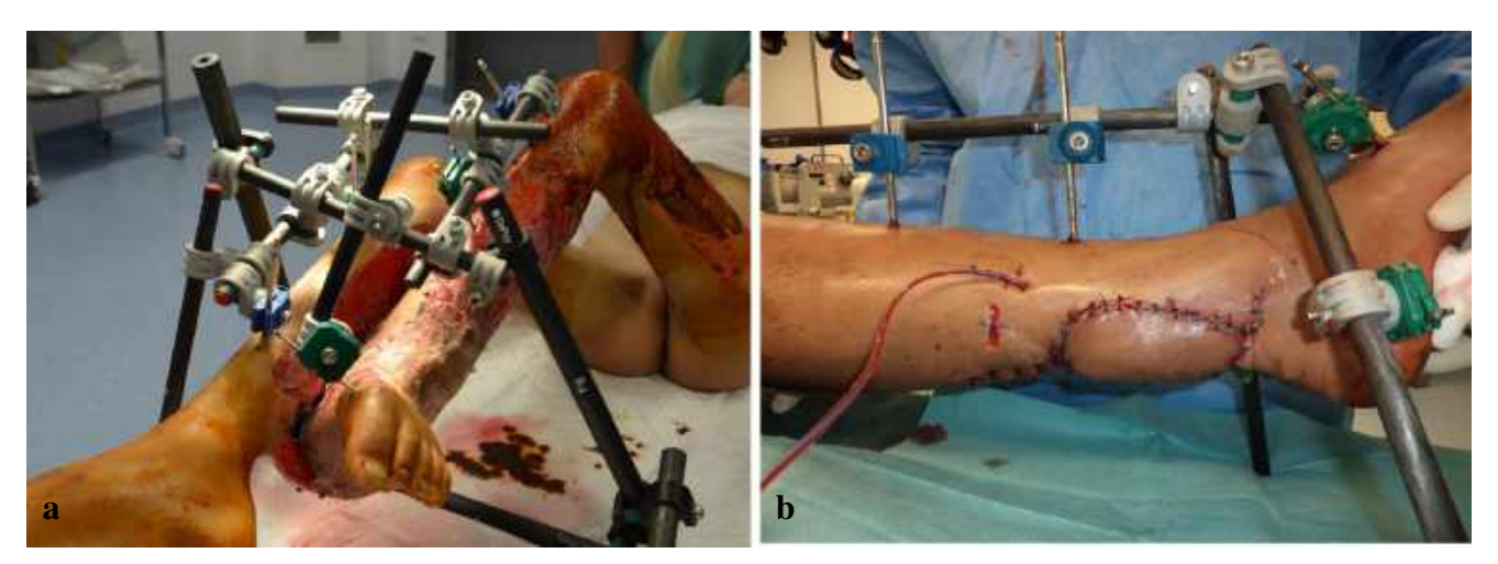
Fig. 2 Use of external fixation to protect two simultaneous cross-leg flaps in a ten-year-old girl (a) and to avoid pressure over an Achilles tendon coverage (b)

Soft-tissue coverage of war extremity injuries in echelon 3 MTFs is a practice seldom analysed in the literature [3, 4, 11]. Marchaland et al. [3] reported the use of pedicled flaps to cover bone exposure of the leg in such conditions in Afghanistan and Ivory Coast. Recently, Klem et al. [4] reported the US military experience performing free flaps in a combat zone, with 21 extremity flaps performed during a 30-month period in both Iraqi and Afghan theatres. The high number of flaps performed in this six-month study can be explained by the location of the KaIA CSH in the centre of Kabul, which is responsible for a specific patient recruitment compared to other NATO CSHs. If war casualties are