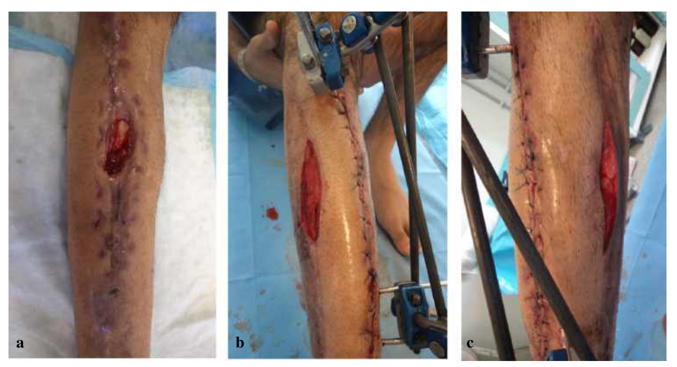
Fig. 3 Delayed coverage of an infected middle third open tibia fracture (a) by two simultaneous local bipedicled translated flaps: lateral (b) and medial (c)