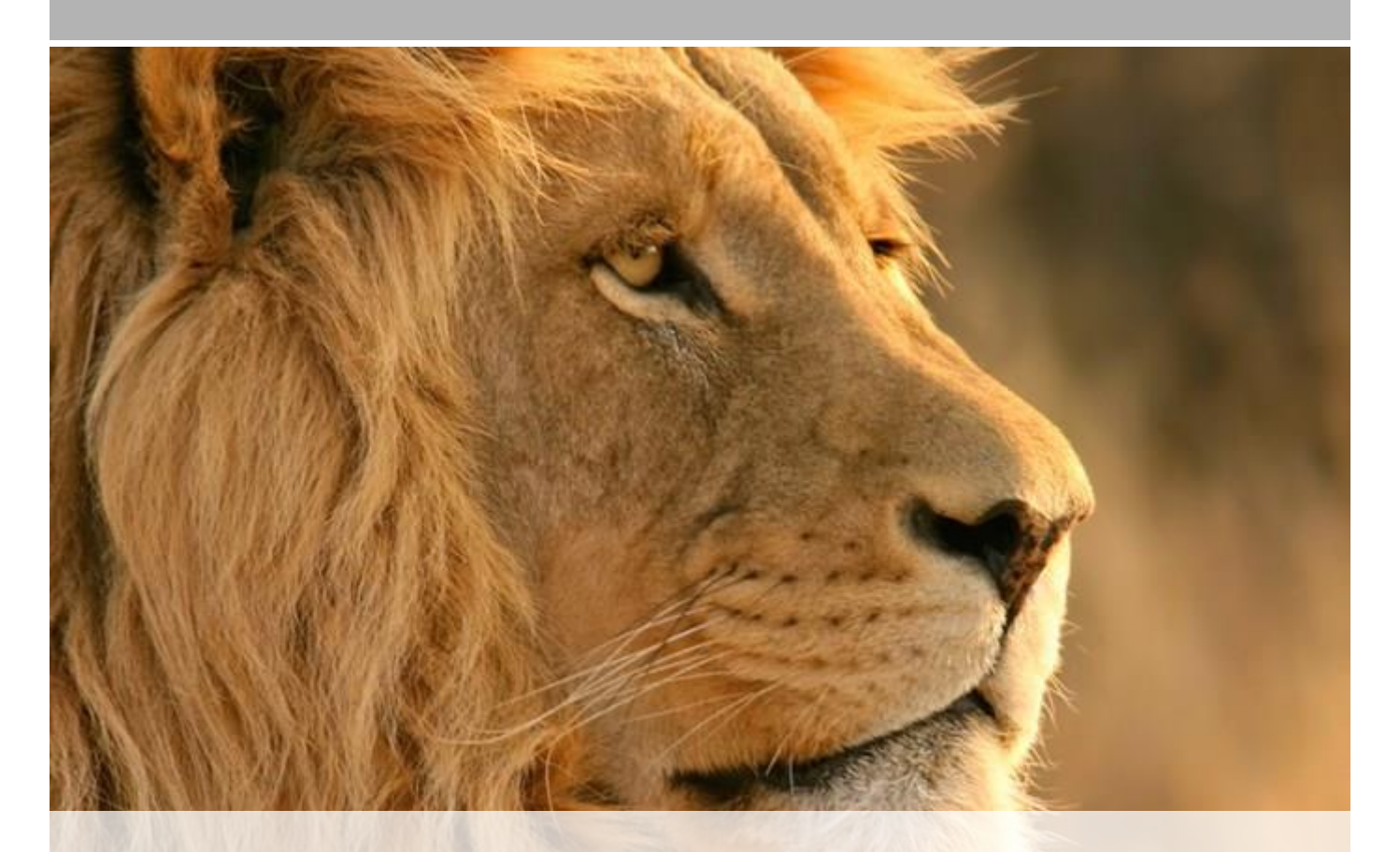
Knysna & Addo Elephant National Park December 03 - 07, 2017