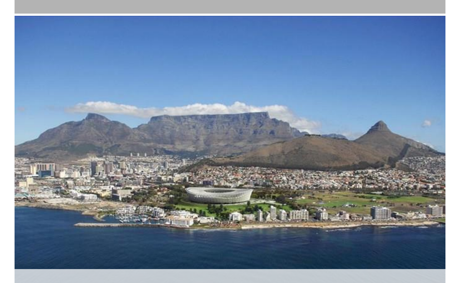
Cape Point and Cape Winelands December 03 - 05, 2017