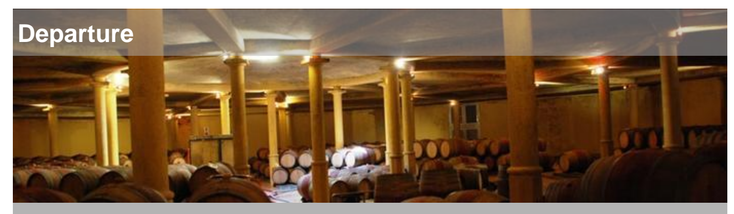
Day 3, Tuesday, 05 December 2017